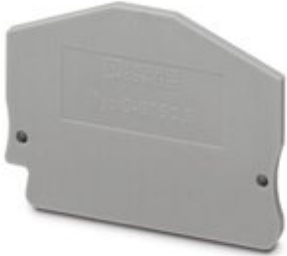
End cover, length: 51 mm, width: 2.2 mm, height: 43 mm, color: gray

Please be informed that the data shown in this PDF Document is generated from our Online Catalog. Please find the complete data in the user's documentation. Our General Terms of Use for Downloads are valid ( http://phoenixcontact.com/download )